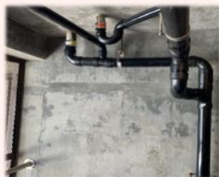
New ABS Pipe