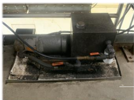
Original Biosolids Hopper Hydraulics Unit

Maintenance and E/I technicians completed a small project to remove and replace the facility's biosolids hopper hydraulic pack in the solids loading bay. This unit operates the hydraulic gates on the sludge hoppers. Once the hydraulic unit was secured to the base, staff connected new hydraulic lines and fittings to run new wires and conduit to the control panel that is now mounted next to the hydraulic unit.