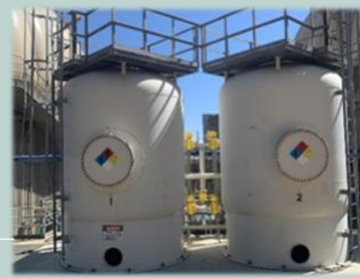
Hydrogen Sulfide Scrubbers

Prior to biogas being used as a fuel in the cogeneration engine, hydrogen sulfide gas is removed utilizing a scrubber system. The media used in these scrubbers periodically require changing out, and this requires a special contractor to do the work. The change out consisted of purging the vessel of biogas, removing both vessel service ports, and completing a confined space entry to chip and vacuum out the 22,000 pounds of media. Once the vessel was empty, new media was installed. This process took approximately two days to complete. The contractor then hauled away the old media, and the unit was returned to service.