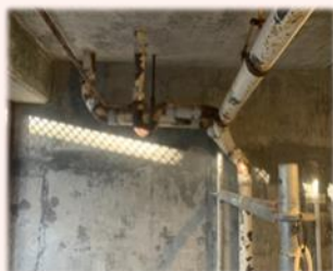
Original Drain Pipe

In June, the Agency completed a plumbing project in the wet well at this pump station. The station's originally installed floor drain system was deteriorating and required a complete overhaul. CMSA had scaffolding installed prior to starting the project and all of the original metal piping and support hangers were replaced with ABS plastic drain piping.