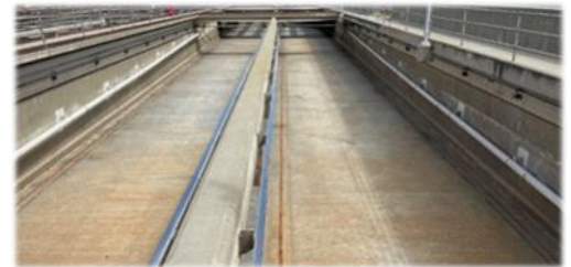
Primary Clarifier #1

CMSA's Capital Improvement Program includes plans to sequentially rehabilitate our seven primary clarifiers between 2024 and 2029. Staff prepared a design for rehabilitation of primary clarifier No. 1 and solicited bids from contractors. GSE construction was the lowest bidder and began work in June. The work includes repairing the deteriorated concrete surfaces and walkways, installing waterproof coating on porous concrete walls, and recoating the metallic clarifier baffles to address observed corrosion. GSE will also install an innovative flow optimization baffle system which is expected to substantially improve the solids removal efficiency of the primary clarifier. The project will be completed by end of September.