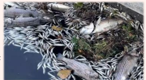
Picture of algae bloom near Treasure Island resulting fish kills in the San Francisco Bay

CMSA issued Request for Proposals to nationally recognized nutrient removal consulting firms to study nutrient removal alternatives and prepare a facilities plan with accurate implementation cost estimates. Proposals were evaluated in July and August, the Board hired a Carollo/Hazen consultant team for the project. A recommendation of the preferred alternative will be provided to CMSA's Board in Summer 2025.