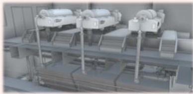
3D model of Centrifuge and Piping Layout