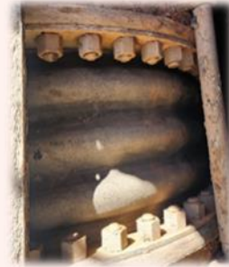
Excavation of expansion joint (left) and close-up view of buried expansion joint