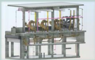
3D Model of Existing Grit Classifier Room

The project team evaluated several layouts for the new grit washers and began developing the detailed design documents. To aid in this effort, Carollo Engineers laser scanned the room and developed a 3D model. The 50% design workshop was held in July, with final design expected to be completed in October, and construction to begin in March 2025. Additionally, the Board approved the pre-purchase of two Huber Coanda grit washers, which will be delivered by the time construction begins.