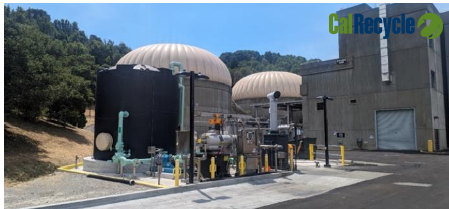
Completed Liquid Organic Waste Receiving Station

The contractor completed installation and testing of all equipment for the new liquid organic waste receiving tank and gas treatment system in April. Staff is routinely using the new above ground tank by receiving liquid food waste slurry and FOG deliveries through the new screening system. This project was funded by CalRecycle's Co-Digestion Grant, and CMSA is expecting to receive full reimbursement for the entire $2.5 million grant by this fall.