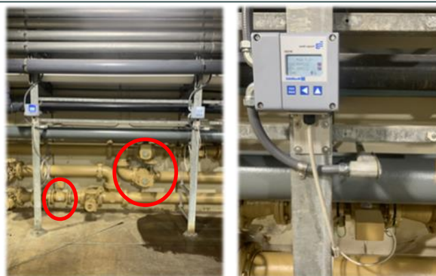
Primary Sludge Flow Meters

The primary sludge flowmeters in operation since 1985, have recently been replaced. Over the past year, these meters had become increasingly unreliable, necessitating additional maintenance efforts to keep them operational. To mitigate disruptions to the solids treatment process, the meter replacement was coordinated with Operations staff. Subsequently, the new meters have been seamlessly integrated into the system, and are actively reporting data to SCADA thereby enhancing operational efficiency and reliability.