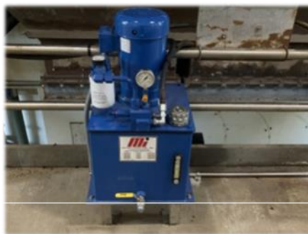
New Biosolids Hopper Hydraulics Unit